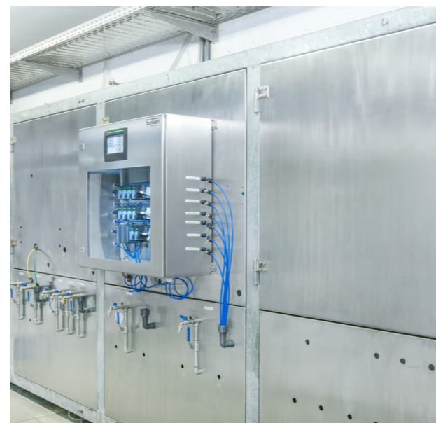
After: Compact installation of measurement technology.